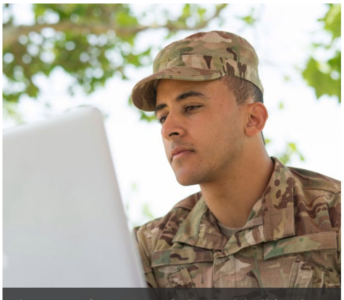
The appearance of U.S. Department of Defense (DoD) visual information does not imply or constitute DoD endorsement.