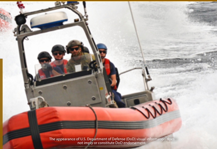
The appearance of U.S. Department of Defense (DoD) visual information does not imply or constitute DoD endorsement.